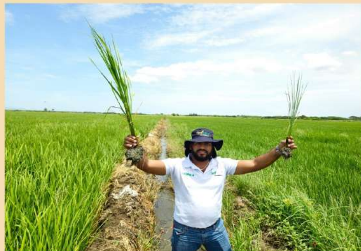
NATURALLY-7 in Rice vs. Conventional Management in a soil with salinity problems.