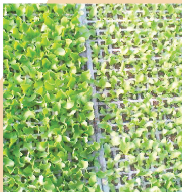
GreenLIFE ENDO™ liquid Control

See for yourself how GreenLIFE ENDO™ gets results!